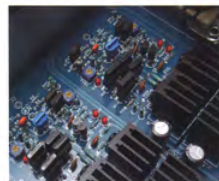
Class-A all-stage DC amplifier circuit configuration

High-performance model offering the electrostatic sound by inheriting the basic structure of upper-class models.