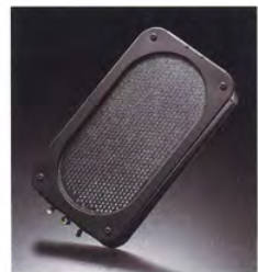
New structure sound element adopted for SR-307.

[SRM-323S Driver unit] ●High-quality non-magnetic resistors of audio grade are employed for the main circuit to greatly improve the tone quality. Also the circuit constant has been looked over again in detail. ●The emitter-follower circuit at the output stage with high-voltage bipolar transistors enabled low output impedance resulting in high drivability and wide high-frequency dynamic range. ●The STAX traditional single amp balanced circuit of simple 2-stage amplification has been adopted for the input stage using low-noise dual FETs of high-quality sound. ●Class-A all-stage DC amplifier circuit configuration eliminated coupling capacitors throughout the signal path. ●One simple RCA input equipped with parallel out directly providing the incoming signal. ●Two 5-pin output sockets connectable to all pro-bias compatible earspeakers.