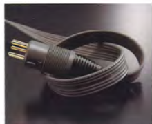
PC-OCC cable with gold-plated plug